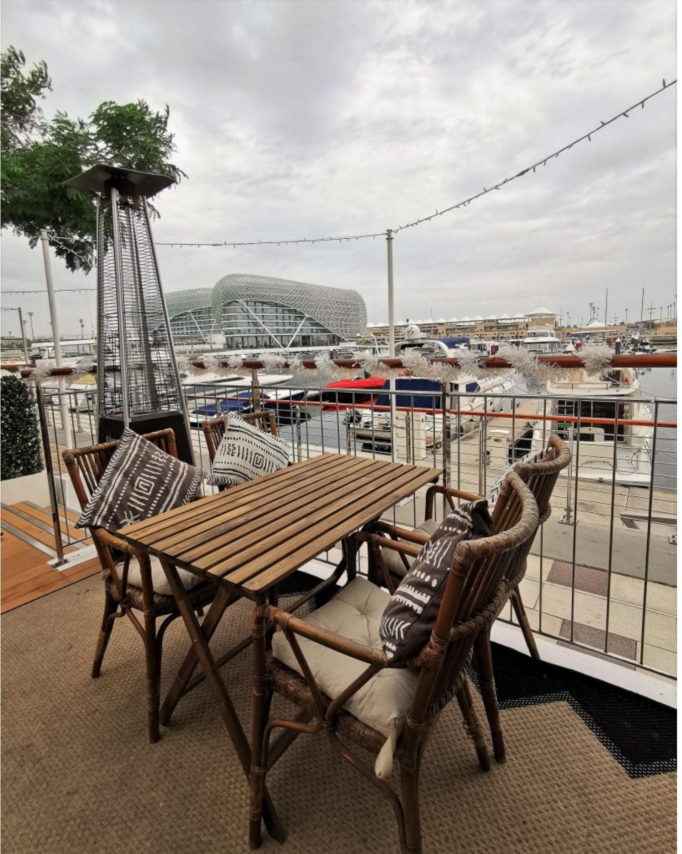
Diablito is a restaurant where you instantly feel comfortable - at home.