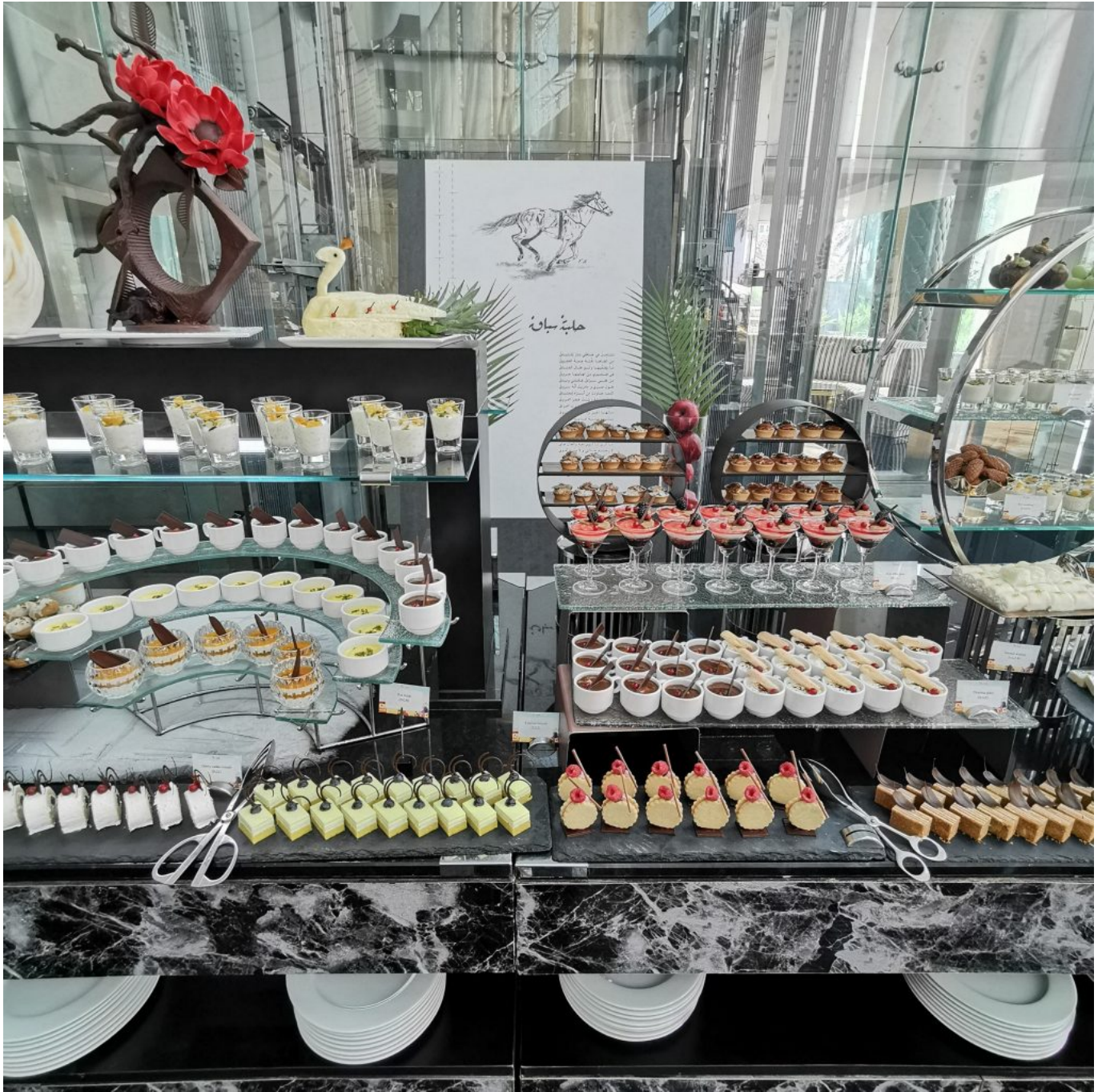
And the main dining hall, with three more complete separate buffet lines, and live stations that I've lost count!