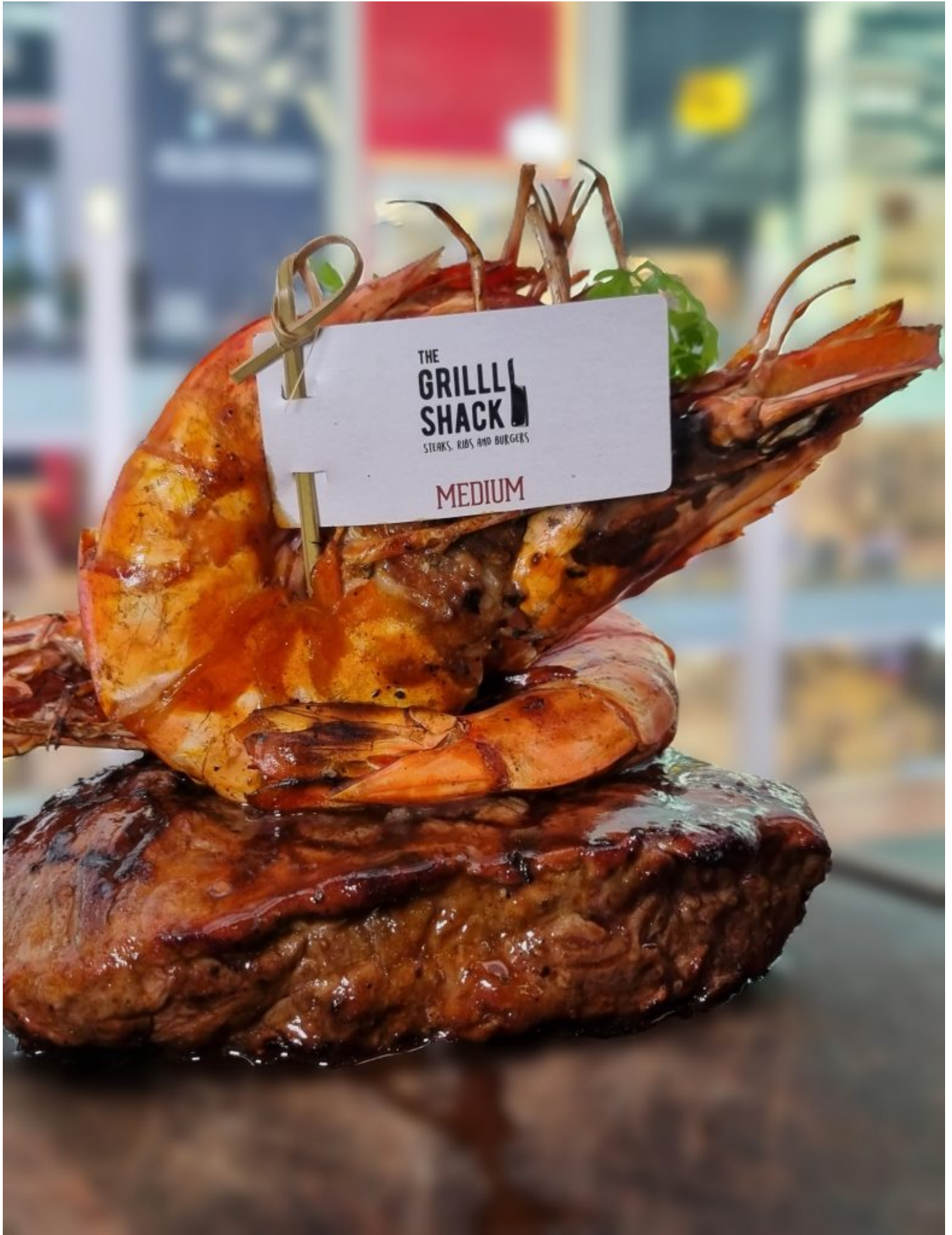
The Surf-N-Turf pairs 300 grams of tender beef with giant Gulf prawns!