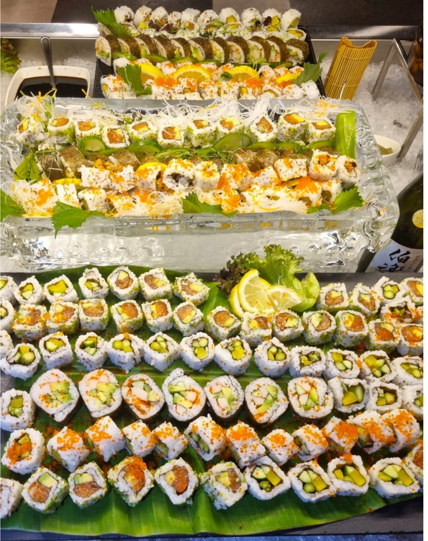
All you could imagine and wish for, really.