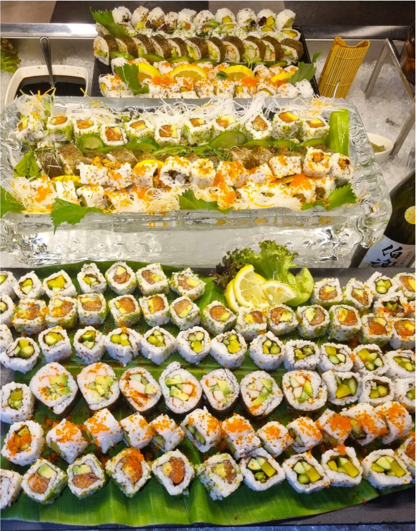
All you could imagine and wish for, really.